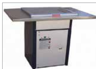
10159 Moodie T-Style Pedestal