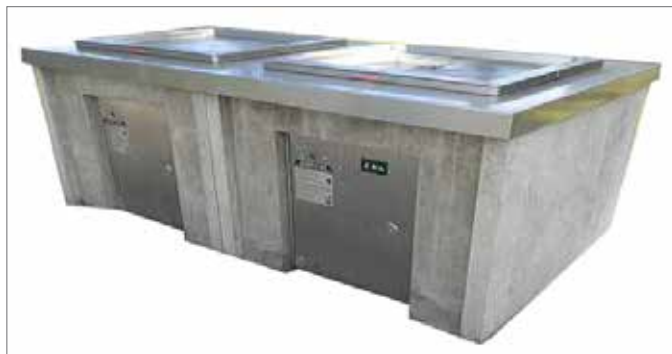
10302 - CARINA DOUBLE