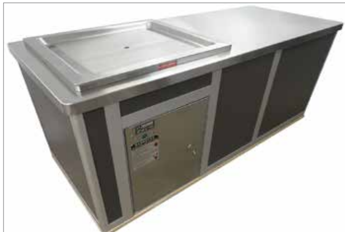
10100 - CROWN ENCLOSURE