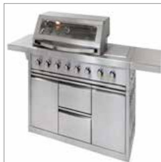
10940 Moodie Platinum II 6 Burner BBQ