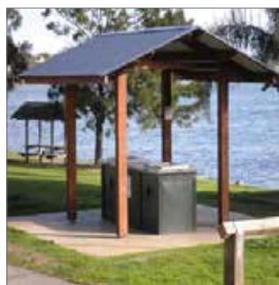
59237 Moodie O MacDonald Shelter Gable 3x3m