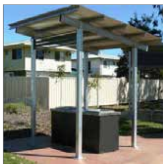
59451 Moodie O Beerwah Steel Skillion 3x3m