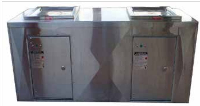
10008 - STAINLESS STEEL ENCLOSURE

Large standard range • Custom work is welcomed