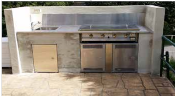
10901 - HERCULES BUILD-IN BBQ