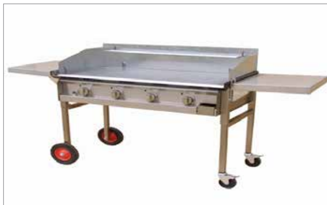
10900 - HERCULES BUILD-IN BBQ