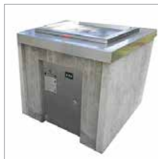
10302 - CARINA