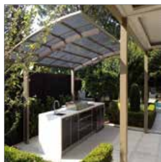
42780 Moodie Cantaport Curve Roof Shelter 5.1x3.0m

Moodie Outdoor Products has an extensive range of parkland Shelters available to provide cover and entertaining areas. Be sure to check out our website for the full range of available shelters or contact us to get a copy of the brochure for our Shelters range.