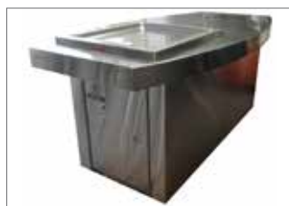
10631 Moodie ArcClassic Pedestal

Moodie Outdoor Products has a range of pedestal style BBQs available. The pedestal style BBQs come ready made for easy installation - just pour a concrete slab to bolt the BBQ to and you're ready to go. Full features and specifications refer to our website.