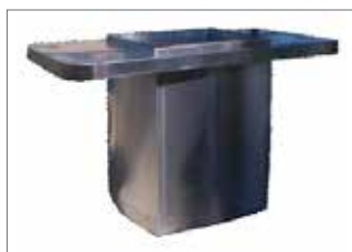
10152 Moodie Royal Pedestal