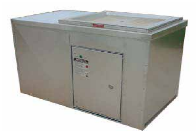
10021 - STAINLESS STEEL ENCLOSURE

Large standard range • Custom work is welcomed