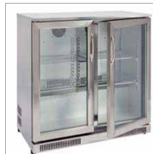
10948 Moodie Platinum II 2 Door (228L) Bar Fridge Module