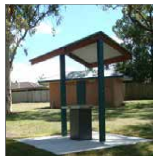
59233 Moodie O MacDonald Shelter Gable 2x2m