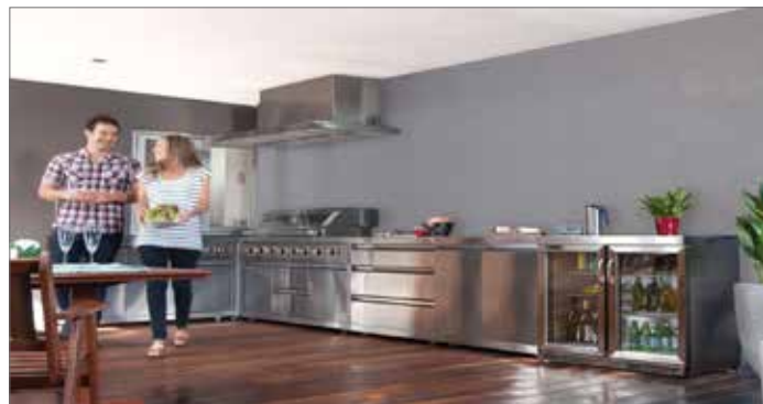
PLATINUM II OUTDOOR KITCHEN

Moodie Outdoor Products is proud to bring you the Platinum II series of modular outdoor kitchen components. Use the variety of modules to create your own stunning outdoor cooking and entertaining area. View our website for the full range of modules available.