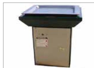
10014 Moodie Deluxe Pedestal