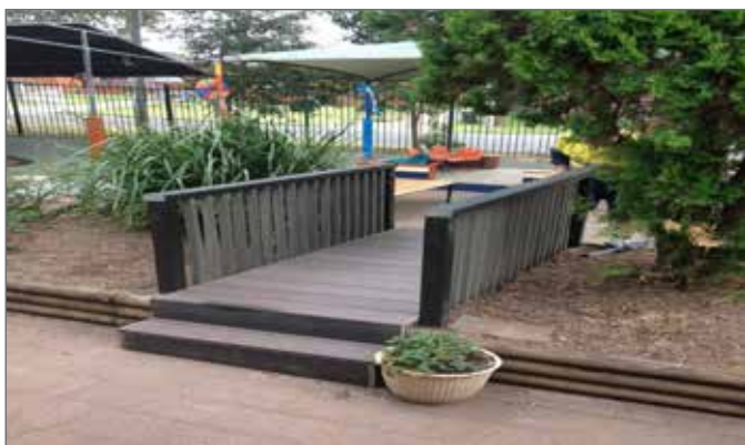
MOUNT DRUITT CHRISTIAN CHILD CARE CENTRE Roocycle ET Playground Bridge with Enviro Decking