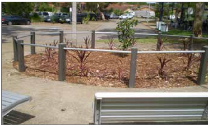
WARRINGAH COUNCIL Killarney Heights Shops: Roocycle ET Bollards 100mm x 100mm