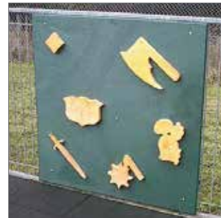
30167 Moodie Roocycle RP Multi Image Panel