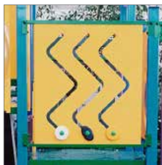
30056 Moodie Roocycle RP Triple Racers