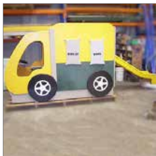
30187 Moodie Roocycle RP Wheat/ Wool Truck with Slide