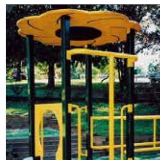
30060 Moodie Roocycle RP Flower Roof