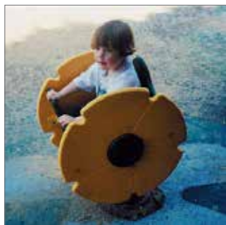
30078 Moodie Roocycle RP Spring Rider Flower

Large standard range • Custom work is welcomed