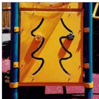
30069 Moodie Roocycle RP Tree Racer