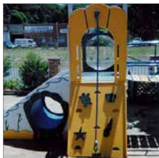
30067 Moodie Roocycle RP Abseiling Wall