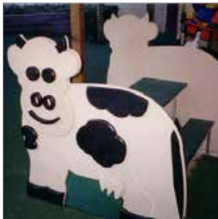
18088 Moodie Roocycle RP Cow Setting for Preschoolers