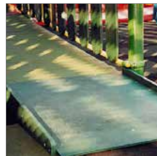
30089 Moodie Roocycle RP Ramp Upgrade