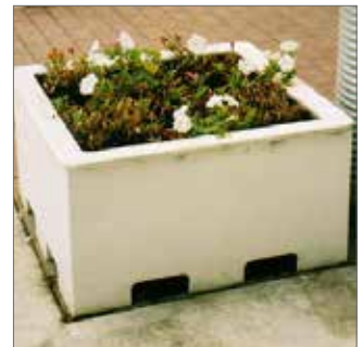
17328 Moodie Roocycle RP Square Planter