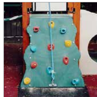
30075 Moodie Roocycle RP Abseiling Ramp