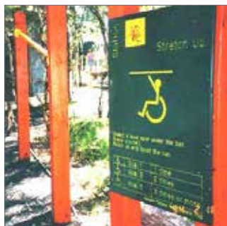
30171 Moodie Roocycle RP Sign - Fitness for Wheelchairs