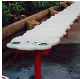
19269 Moodie Roocycle RP Worm Bench All Legs 1200 Modules