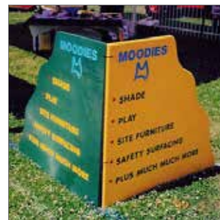
35001 Moodie Roocycle RP Signs