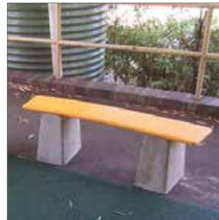
19272 Moodie Roocycle RP Bench on Double Olympic Bases