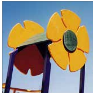
30064 Moodie Roocycle RP Flower Roof