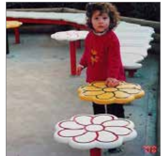
19274 Moodie Flower Bench 300 dia