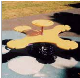
30063 Moodie Roocycle RP 4-way Spring Rider