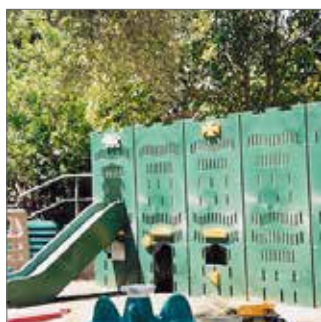
30037 Moodie Roocycle RP Castlerama

Large standard range • Custom work is welcomed