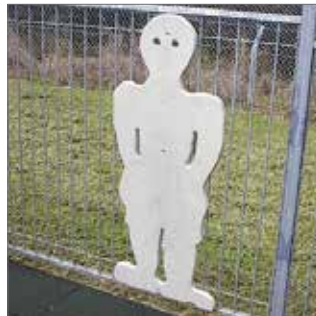
30166 Moodie Roocycle RP BOY Image Panel