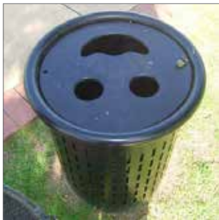
12004 Moodie Roocycle RP Smile Lid

Large standard range • Custom work is welcomed