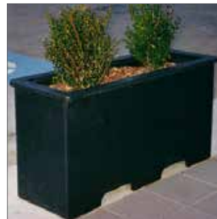
17318 Moodie Roocycle RP Rectangular Planter