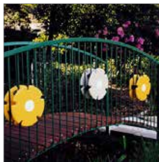
30084 Moodie Roocycle RP Flower Bridge