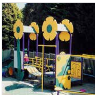
30040 Moodie Roocycle RP Flower Shop