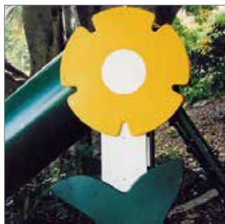
30082 Moodie Roocycle RP Flower Tube Slide