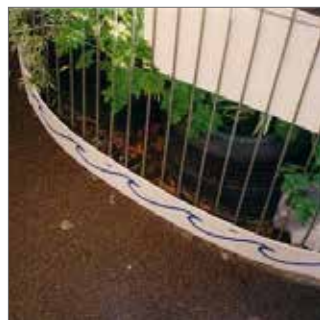
25895 Moodie Roocycle RP Edging with highlights