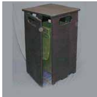
12339 Moodie Roocycle RP Flat Top 120L Litter Receptacle