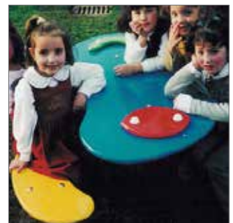
30025 Moodie Roocycle RP Play Setting