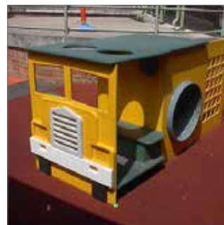
30007 Moodie Roocycle RP TruckMate