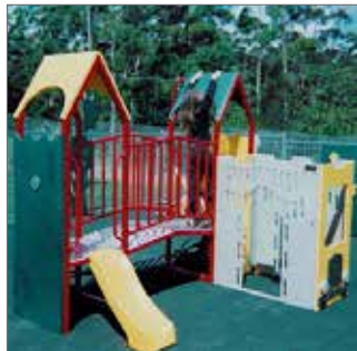
30161 Moodie Roocycle RP RTA Buladelah