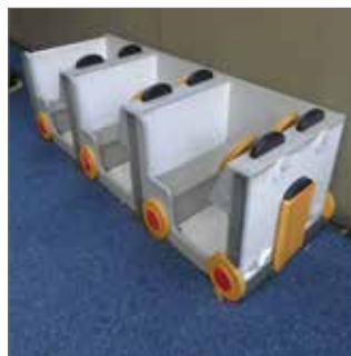
30190 Moodie Roocycle RP Mini Drive Triple Road Train