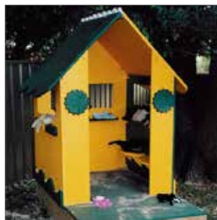
30070 Moodie Roocycle RP Ardo Cubby