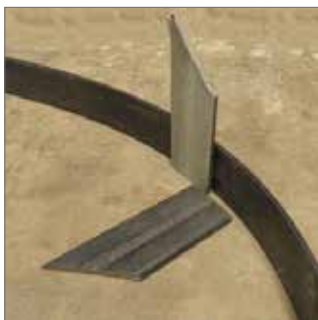
25892 Moodie Roocycle RP Edging with Pegs