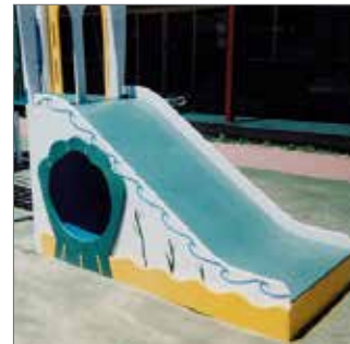
30066 Moodie Roocycle RP Wide Slide with Tunnel Highlights