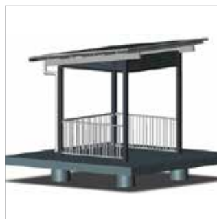
59450 - BEERWAH