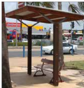
59090 - BULLER