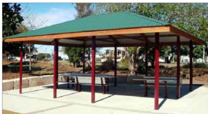
59670 - CARRUTHERS