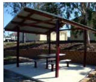
59235 - MACDONNELL