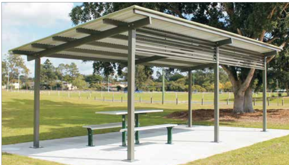
59630 - CRESCENT - 4X9M