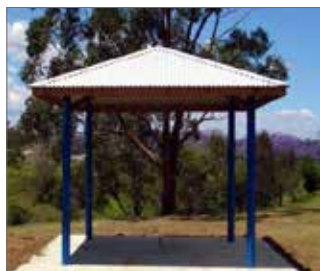
59351 - KOSCIUSZKO