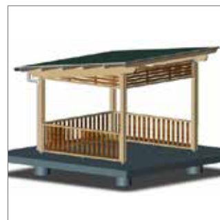
59400 - SNOWY