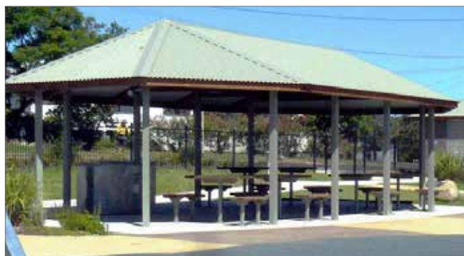
59650 - TEVIOT