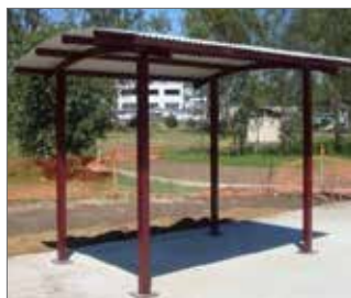
59500 - WOODROFFE