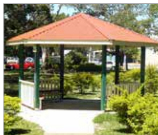
59300 - NORTHCOTE