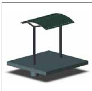
59050 - BUFFALO