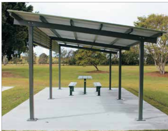
59630 - CRESCENT - 4X9M

Installation with concrete slab, Australia wide