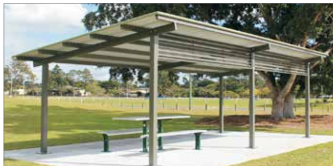
59630 - CRESCENT