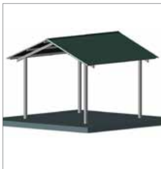
59335 - GIBRALTAR