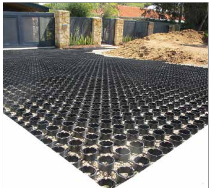
22405 - ROOCYCLE GR