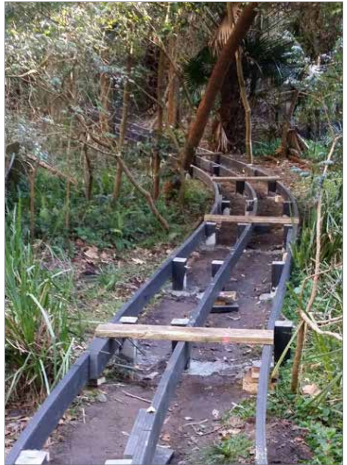
72242 - FRED HOLLOWES RESERVE