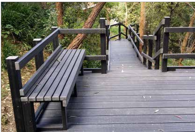
72241 - FRED HOLLOWES RESERVE