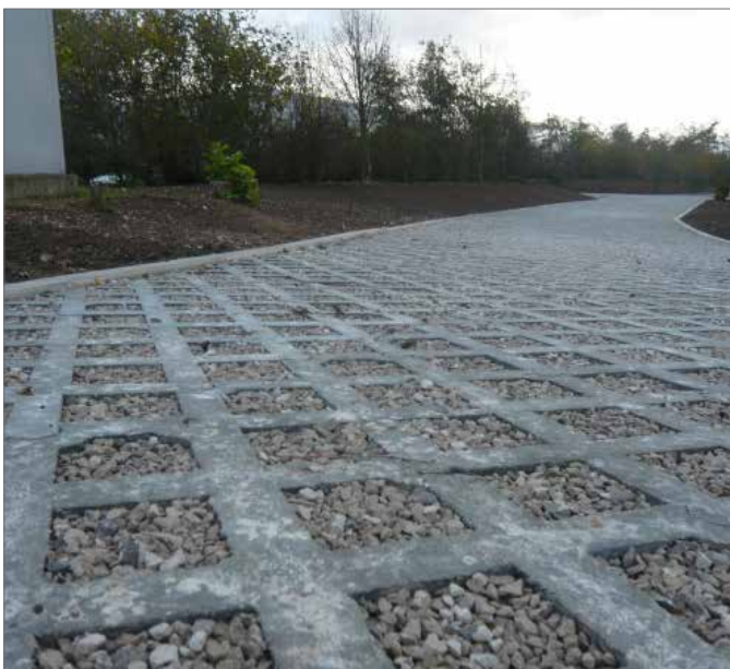
22705 - ROOCYCLE ENVIROPAVER

Roocycle Permeable Pavers are also available. These allow rain water to be absorbed into the ground and are ideal for areas where water runoff can be an issue.