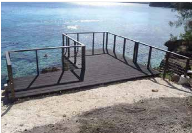
72870 - VIEWING PLATFORM

The Roocycle range of materials are ideal for use in Marine Environments as the Roocycle Material does not permeate water. Perfect for Viewing Platforms and Boat Ramps.