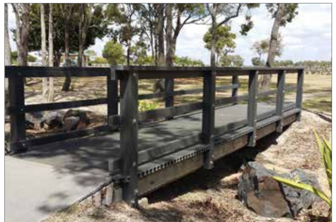
72680 - PEDESTRIAN BRIDGE