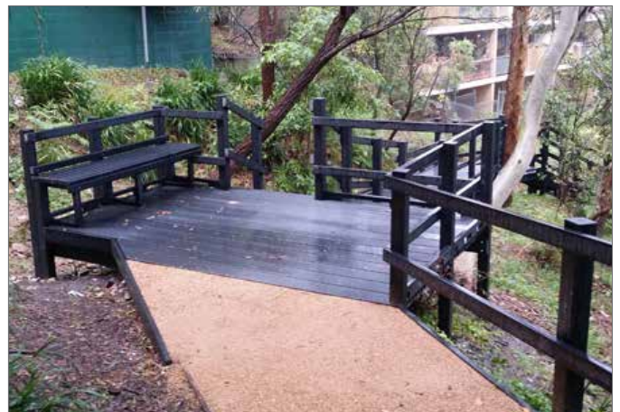
72240 - FRED HOLLOWES RESERVE