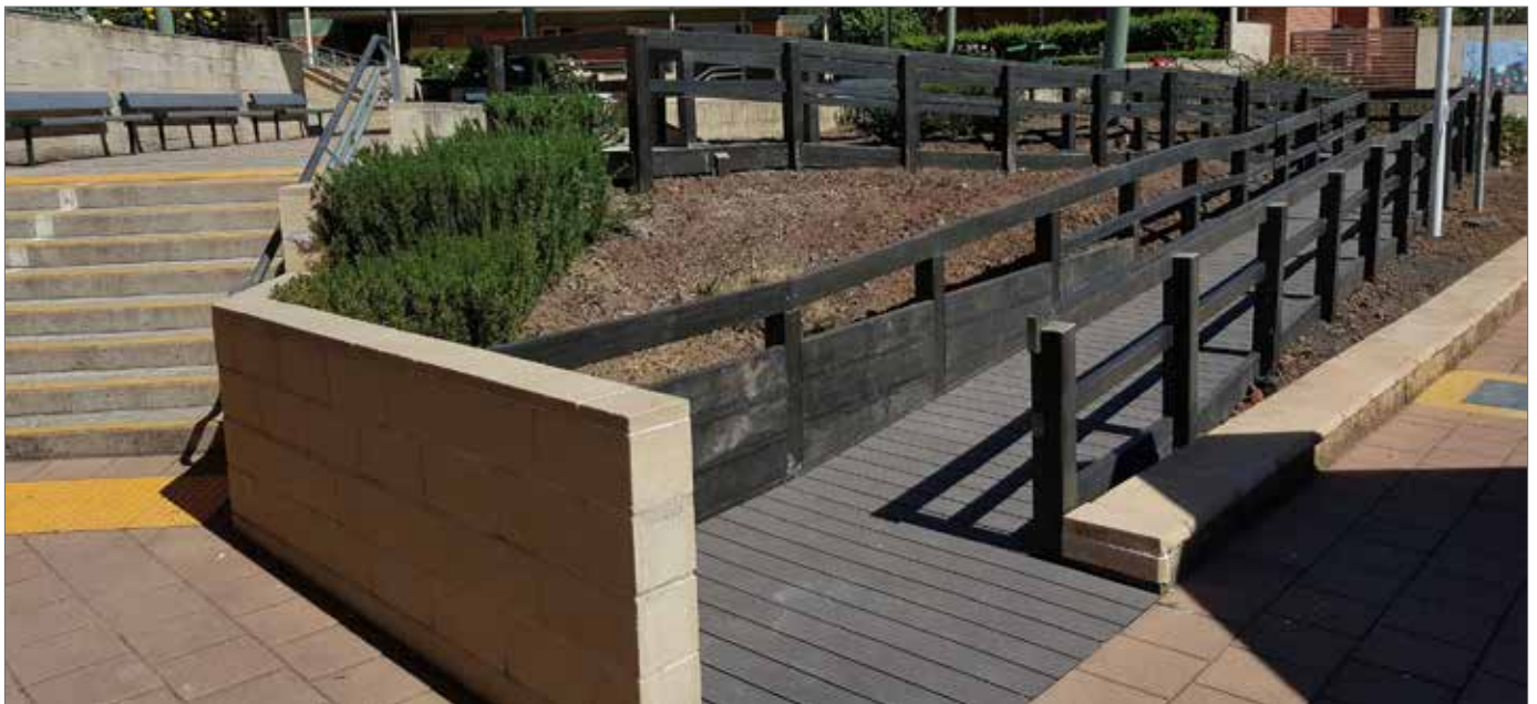
72076 - CORPUS CHRISTIE ACCESS RAMP