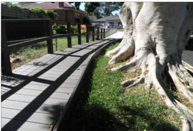
72101 - BOARDWALK