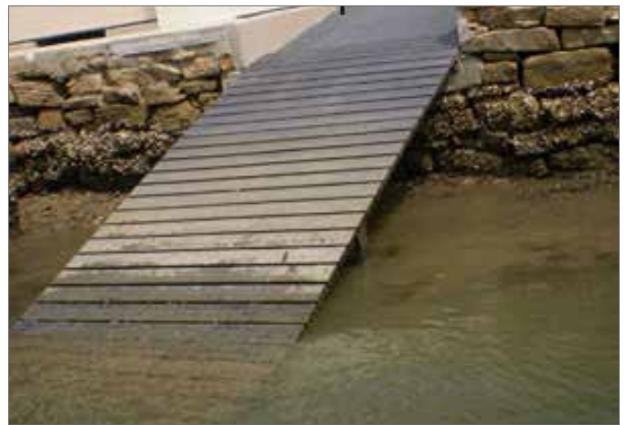
72333 - BOAT RAMP